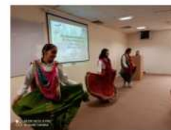
Celebration of Haryana Day