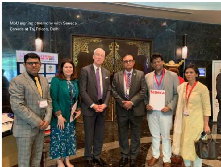
MoU signing ceremony with Seneca, Canada at Taj, Palace, Delhi