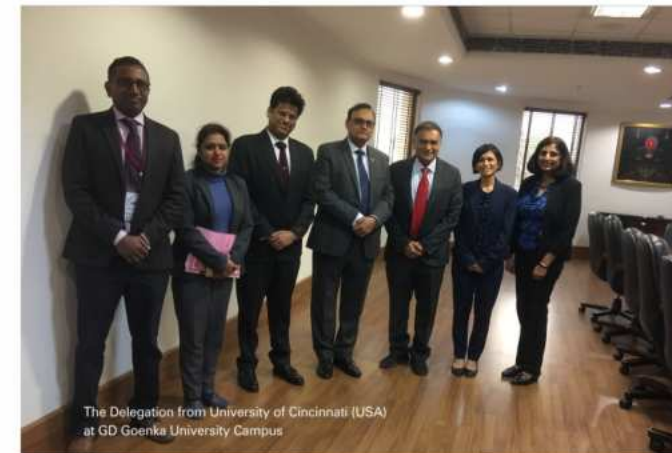
The Delegation from University of Cincinnati (USA) at GD Goenka University Campus