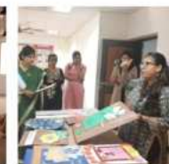
Celebration of Diwali Festivities with Various Inter-house Cultural Competitions