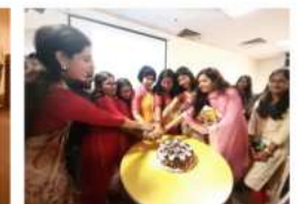
Celebration of Teachers' Day