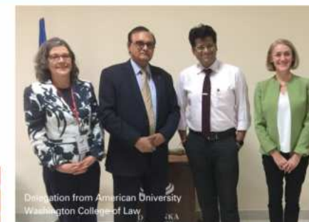
Delegation from American University Washington College of Law