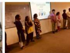
Celebration of Hindi Diwas