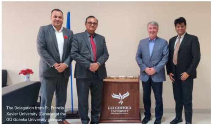
The Delegation from St. Francis Xavier University (Canada) at the GD Goenka University campus.