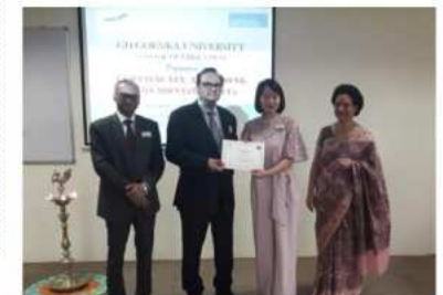
Organisation of a certificate awarding ceremony on 13 August 2019 for the first batch of 'Certificate in Progressive Teacher Training in Montessori Education'. It is a six-month long course that runs in G D Goenka La Petite Schools.